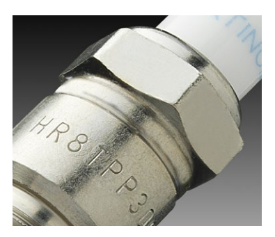
Overt coding: Permanent code