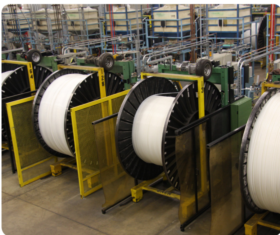
Spools of tubing in Uponor’s facility in Apple Valley, MN.

In addition to the ease of integration, Videojet also offered Uponor a wide selection of ink options. This is important given Uponor needed to find inks that would adhere and withstand extreme temperatures and the life of the pipe. While the testing was extensive – Uponor needed to run through 10 to 16 different internal tests, some of which took four weeks – Videojet was up to the task and supplied many inks for these tests to uncover the right ones for Uponor’s unique applications.